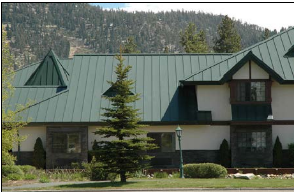
(Above) The only difference is an hour in time and the changing angle of the sun

Conditions such as the time of year, the viewing angle, and the angle at which sunlight strikes the panel may also have an impact on the ability to discern oil canning. The eye perceives the reflection of light, and when the reflective surface is irregular the reflected light is also irregular making it more perceptible. If oil canning is present, it is usually apparent at the time of construction.